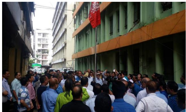
Flag Hoisting at Guwahati