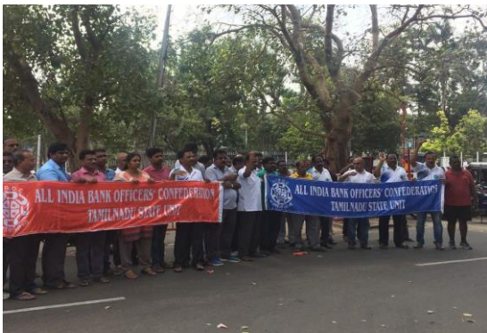
Demonstration in front of RBI by Tamilnadu State Unit