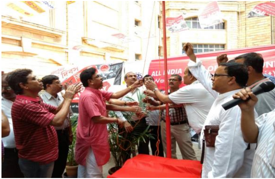
Flag Hoisting at SBI, LHO, Kolkata