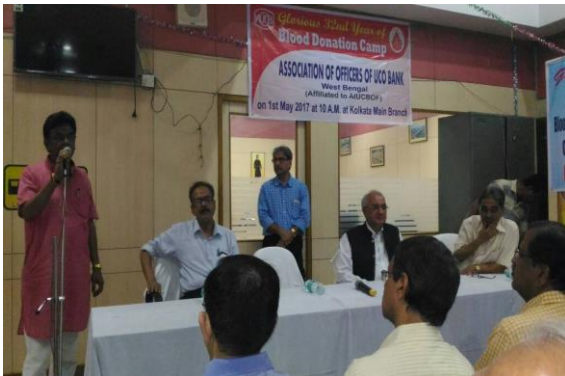
Blood Donation Camp of AIUBOF