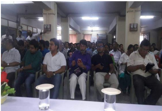
Members meet at Guwahati