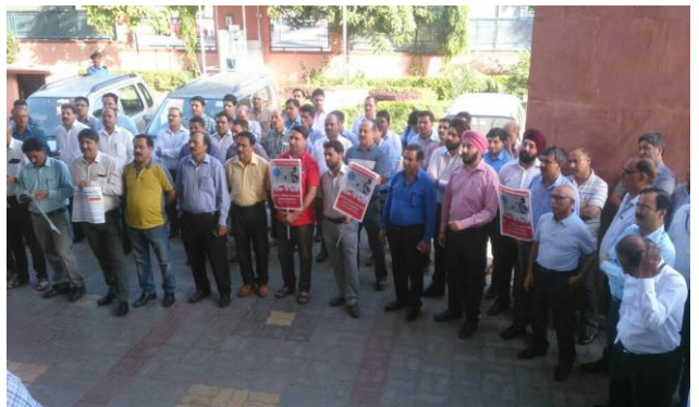
May Day – Demonstrations at Jammu.