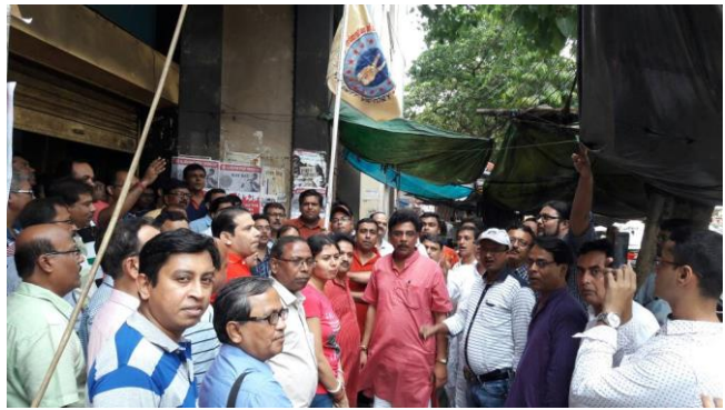
Flag hoisting in Bank of India, Kolkata